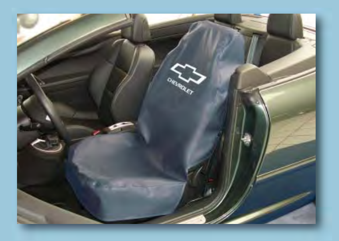
Seat cover for CHEVROLET