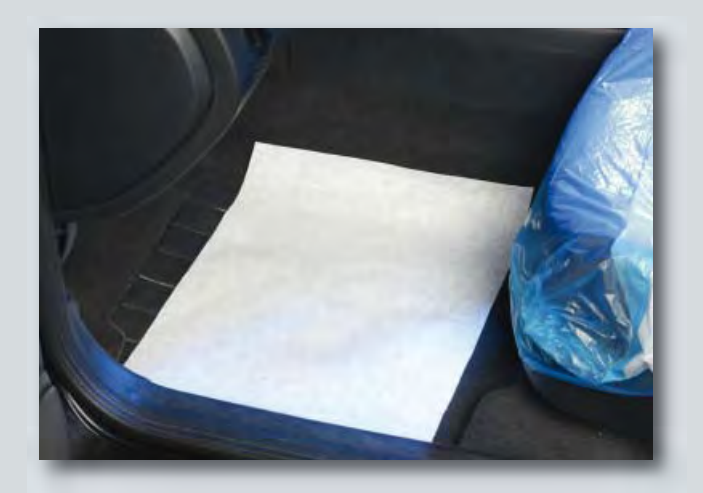
Floor protection, crepe paper

(without picture) made of white polyethylene, on a compact roll, size: 550 \times 610 \text{ mm} , 500 units per compact roll.