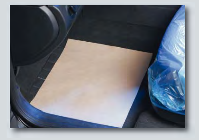
Floor protection, crepe paper

made of strong crepe paper, size: 370 x 500 mm, 500 units per compact roll.