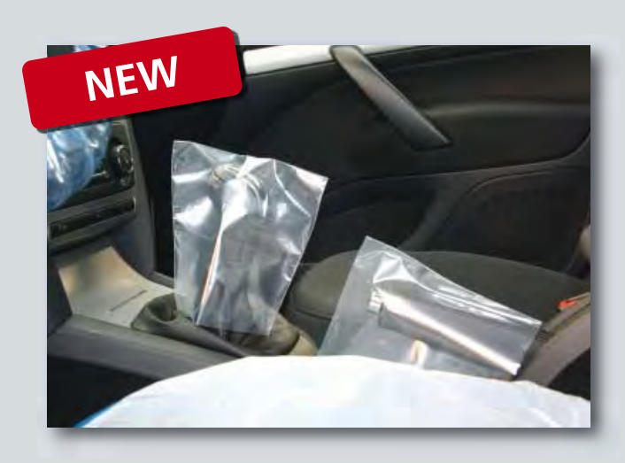
Disposable cover for gear shift and handbrake

made of transparent polyethylene, (O/N D-SH 2020) size: 145 x 160 mm, 500 units per box.