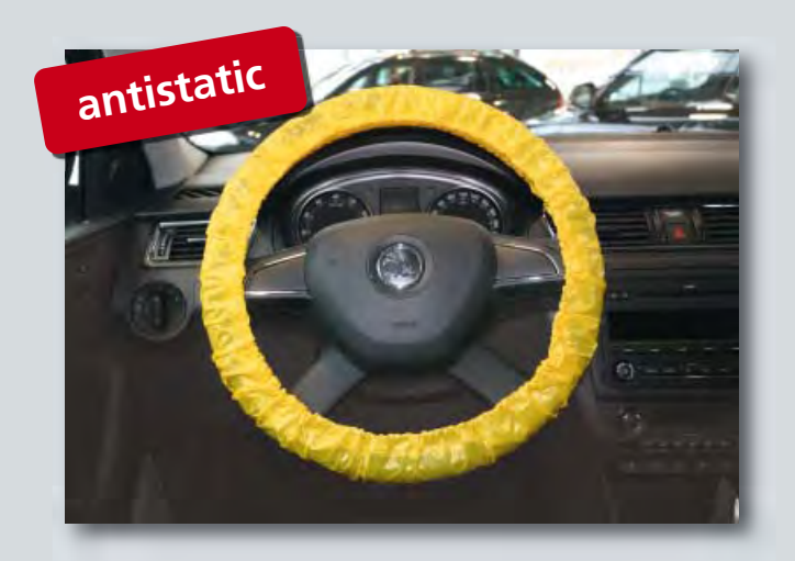
Reusable steering wheel cover "antistatic" (O/N D-L 3100) protection of electronic devices against electrostatic discharge, elasticated, for passenger cars and lorries, made of extra strong polyethylene with antistatic material fractions, yellow identification colour, 20 pieces per box.