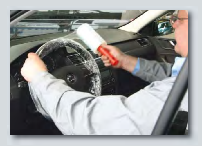
Disposable steering wheel and gear shift cover (O/N D-L 42) for steering wheels of passenger cars and lorries, adhesive polyethylene foil with handle, for about 250 applications.