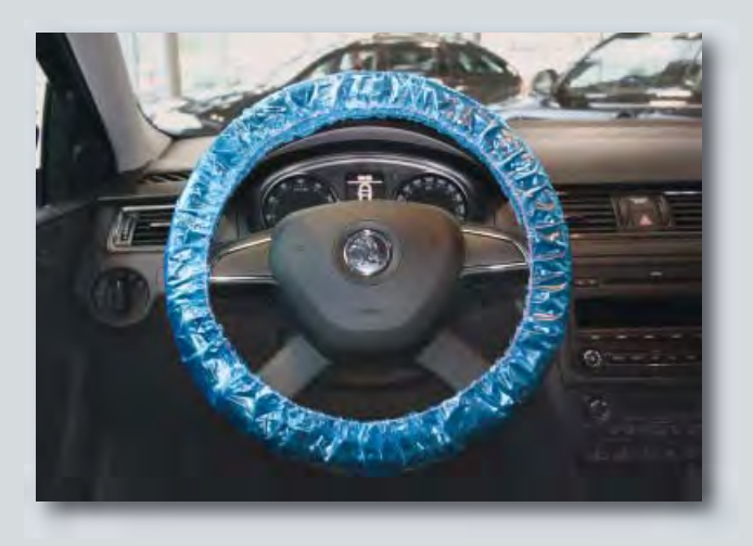
Reusable steering wheel cover elasticated, for passenger cars, made of extra strong polyethylene, colour: blue, 20 pieces per box.