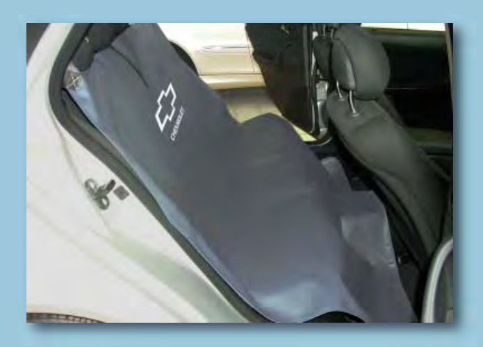
Back seat bench cover for CHEVROLET