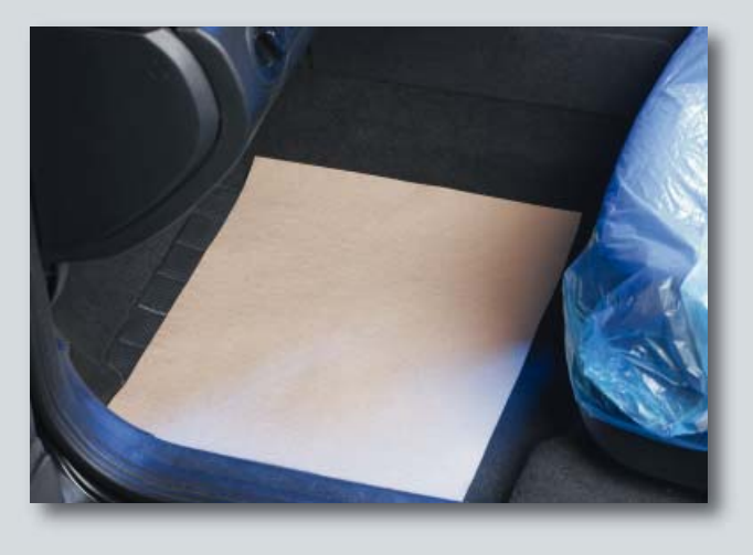
Floor protection, crepe paper

made of strong crepe paper, size: 370 x 500 mm, 500 units per compact roll.