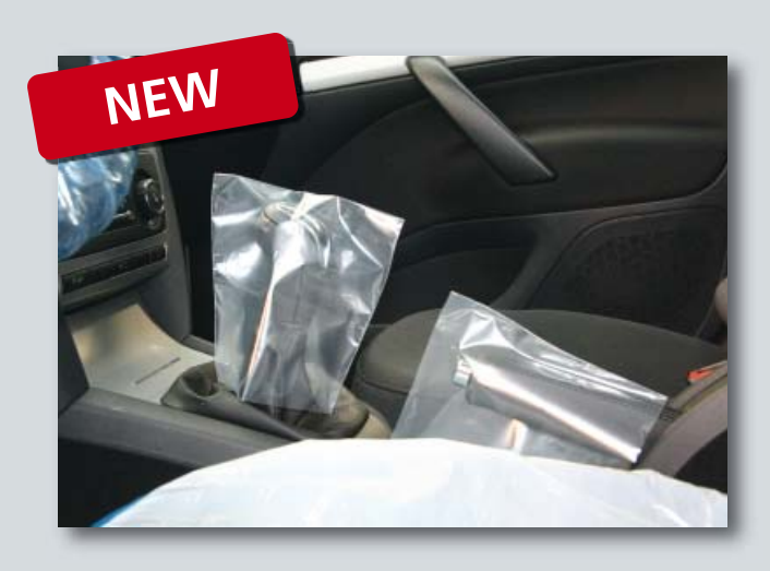
Disposable cover for gear shift and handbrake

made of transparent polyethylene, (O/N D-SH 2020) size: 145 x 160 mm, 500 units per box.