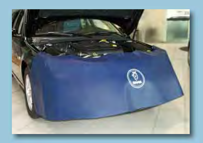
Brand specific front cover for Saab