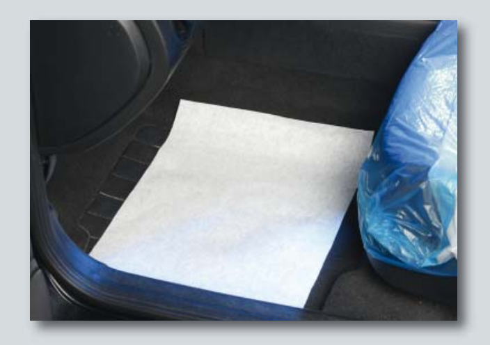
Floor protection, crepe paper

size: 550 x 610 mm, 500 units per compact roll.