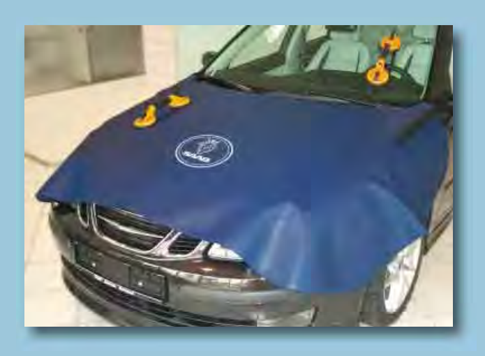
Brand specific bonnet cover for Saab

Made of blue foam-coated artificial leather, with extra strong additional padding. With white imprint of the Saab logo to support the workshop's image. Non-scratch attachment without magnets. Size: approx. 113 x 69 cm