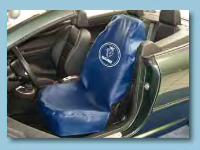
Seat cover for Saab

With white imprint of the Saab logo to support the workshop's image. Simple and strong attachment by suction cups on a web belt. Size: approx. 150 cm x 145 cm