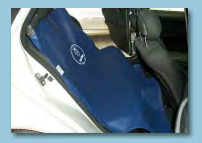
Back seat bench cover for Saab