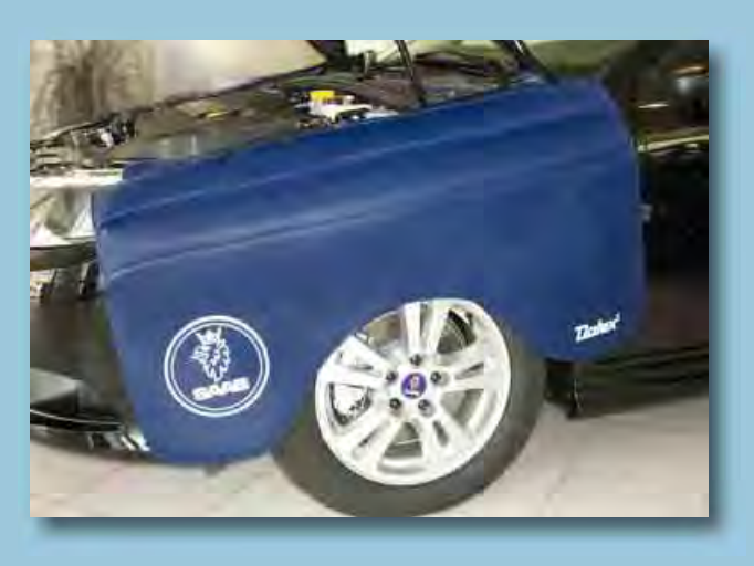
Brand specific fender covers for Saab