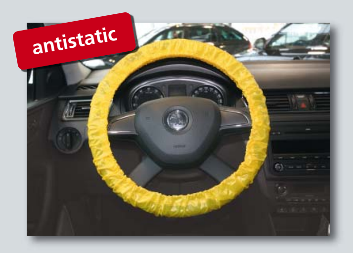
Reusable steering wheel cover "antistatic" (O/N D-L 3100) protection of electronic devices against electrostatic discharge, elasticated, for passenger cars and lorries, made of extra strong polyethylene with antistatic material fractions, yellow identification colour, 20 pieces per box.