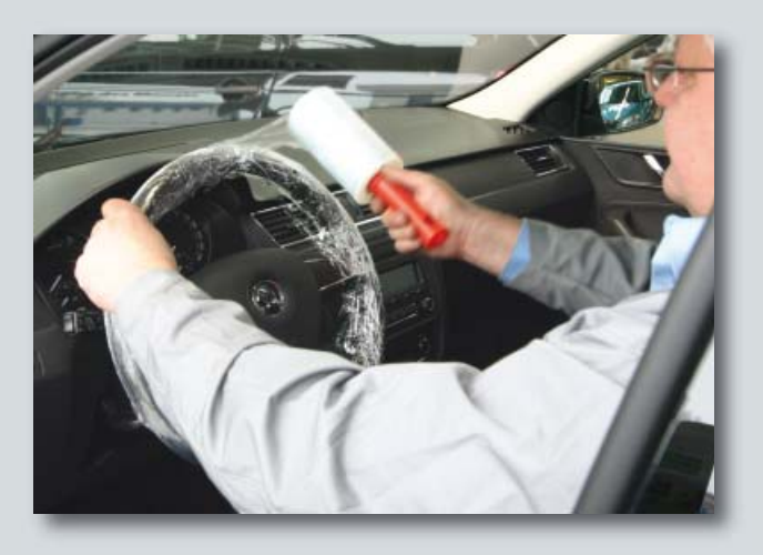
Disposable steering wheel and gear shift cover (O/N D-L 42) for steering wheels of passenger cars and lorries, adhesive polyethylene foil with handle, for about 250 applications.