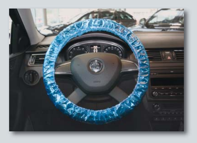
Reusable steering wheel cover elasticated, for passenger cars, made of extra strong polyethylene, colour: blue, 20 pieces per box.